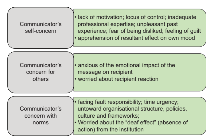
Figure 1: Main reasons for the occurrence of MUM effect.

"MUM" effect reflects the "there is an elephant in the room" situation, where there is an obvious problem or difficult situation that people do not want to talk about, at least publicly.[9] However, lapses in performance are part of our daily life. Once we accept this fact and also that communicating "unpleasant" messages about such lapses can