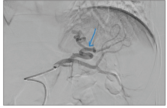
Figure 2: Selective splenic artery angiogram: Blue arrow shows a tortuous tuft of dilated vessels in the fundus of the stomach arising from short gastric artery (branch of the splenic artery). No active extravasation of contrast with no early draining vein.

Accurate diagnosis and management are vital as the mortality rate due to GI bleed reduces significantly from untreated lesions (80%) to treat ones (8%).[3] Direct endoscopic visualization of Dieulafoy's lesion is the gold-standard method for the diagnosis. Endoscopy can be challenging in certain circumstances such as active bleeding (obscuring the bleed site), in intermittent bleeds, and if the lesion occurs at "blind spot" like the fundus of the stomach. If lesions are not detected by endoscopy, a contrast CT scan can help in the diagnosis as well as management with endovascular intervention. The advantage of CT scan and digital subtraction angiography is that it can detect tortuous tuft of vessels even in the absence of active extravasation. The absence of an early draining vein