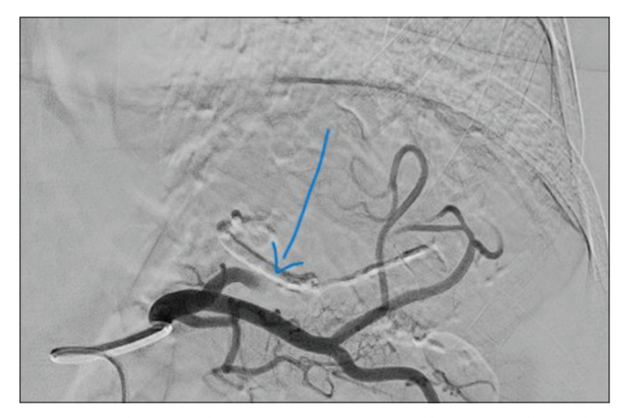
Figure 3: Selective splenic artery angiogram: Blue arrow shows that the lesion was embolized using n-butyl cyanoacrylate (glue) with post-embolization angiogram which showed complete obliteration of the lesion.

in the angiogram is a vital sign to differentiate the lesion from angiodysplasia and arteriovenous malformation.