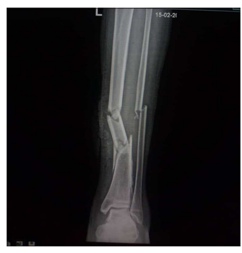
Figure 2: X-ray of a 24-year-old male with Gustilo–Anderson II segmental tibial fracture to be fixed with SIGN intramedullary nailing. SIGN: Surgical implant generation network