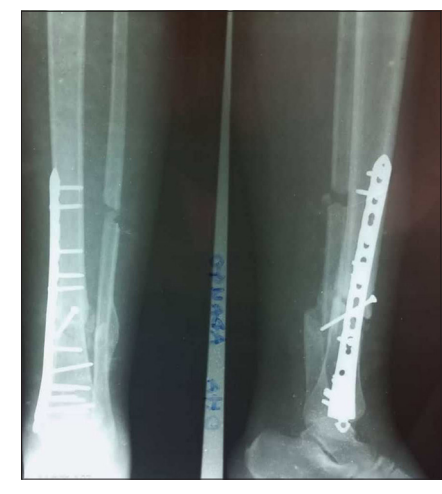
Figure 5: Post-plate fixation radiograph.