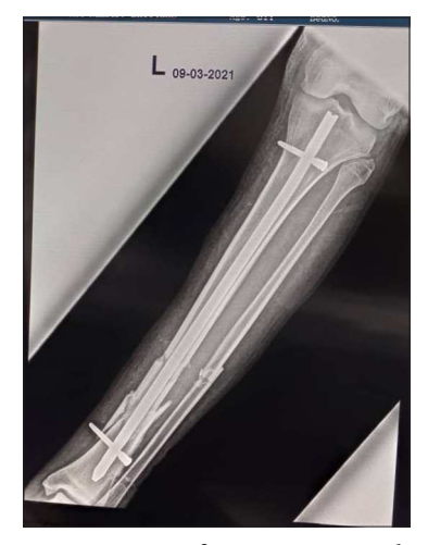
Figure 3: Post-fixation X-ray with intramedullary nailing.