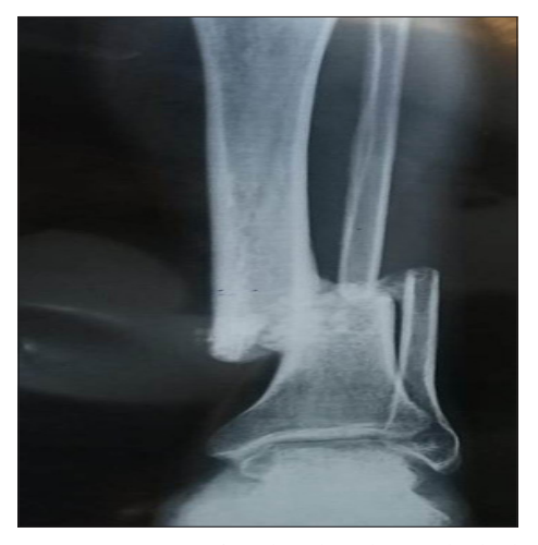
Figure 4: X-ray of a closed mal-united tibial shaft fracture in a 44-year-old female.