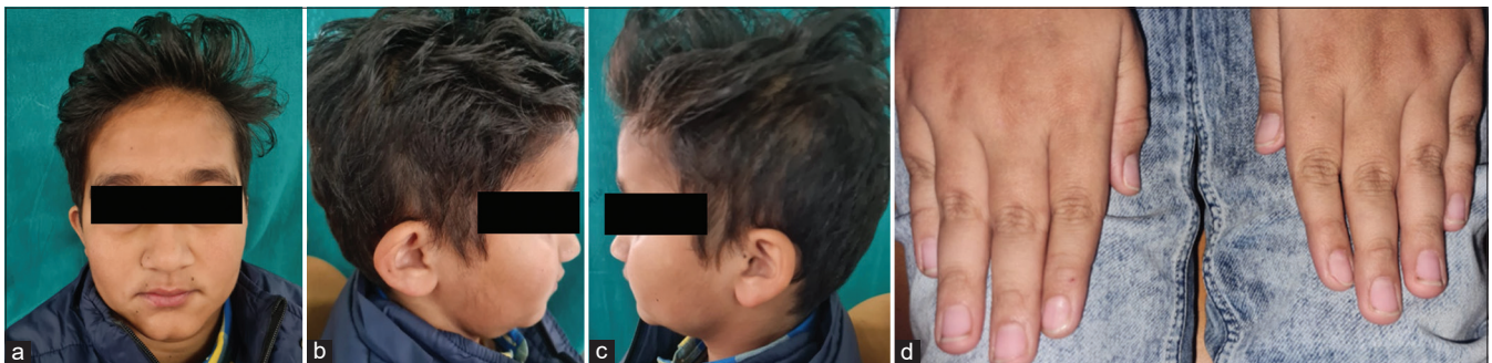
Figure 1: (a-c) Extraoral photograph showing frontal bossing, prominent supraorbital ridge, thick lower lip, sparse hair, sunken cheeks, and scanty eyebrows, (d) photograph showing brittle nails.

Group A disorder which involves defect of at least two ectodermal structure as mentioned above, with or without defects of other structure.