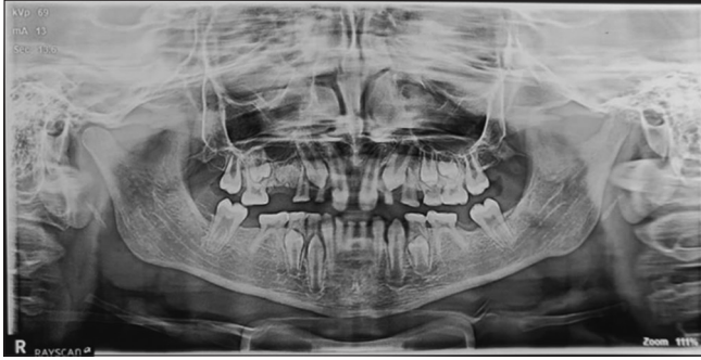
Figure 3: Panoramic radiograph showing multiple missing tooth buds with unerupted tooth buds including maxillary right canine and second premolar, maxillary left canine, first and second premolar, mandibular right canine and first premolar, and left first premolar.

Group B disorder which involves one of the classical ectodermal structure including hair, nail, teeth, or eccrine glands in combination with the defect in any of the ectodermal structure (ear, lip).